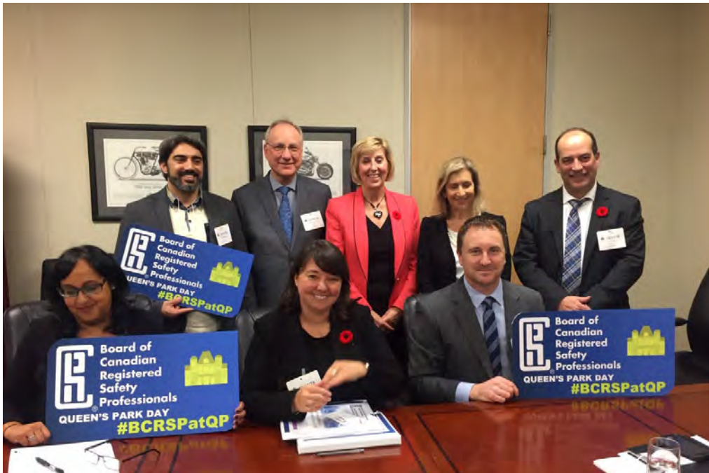
Representatives of the BCRSP meeting with Ontario Minister of Labour Honourable Laurie Scott, MPP on October 31, 2018 at Queen's Park to talk about the importance of workplace safety.

A collaboration with CSSE commenced with work focused on the development of a National Framework intended to conceptualize a model of collaboration amongst professional bodies that will help ensure a consistent application of a national standard as regulatory efforts develop in each province and territory. This framework, called the National Framework, is a system of organization intended to foster communication and linkages among organizations, and to minimize administrative and other process duplication to realize a resource effective business model.